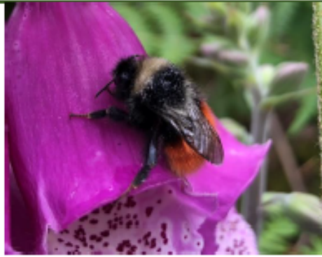
Bilberry Bumblebee, Queen This is a rare bee found more often in upland and moorland habitats. Take a photo for us if you think you have spotted this one please.