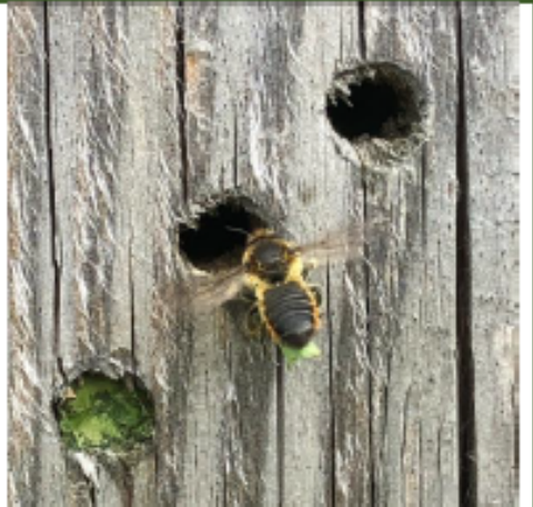
Leaf Cutter Bee There are a few different species of leaf cutters but look out for bees carrying little cut sections of leaf or garden plants. They stick the bits of leaf together to make nest cells for their young. The female don't have pollen hairs on their legs, but under the end of the abdomen.