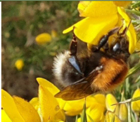
Tree Bumblebee, Queen This bee only came to the UK from Europe in 2009 and is now found as far north as Scotland. It's a distinctive bee, with an orange brown thorax and a black abdomen with a white tip. They often nest in trees and bird boxes.