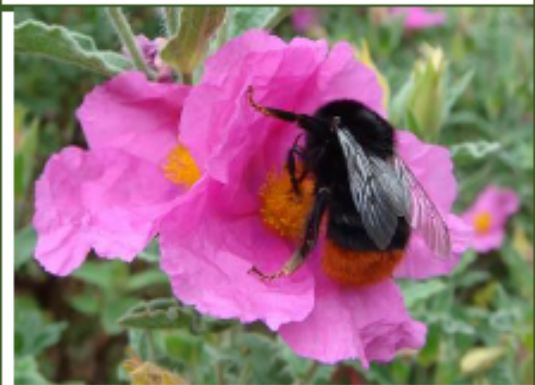
Red Tailed Bumblebee, Queen Nice and easy to identify, black with a red tail.