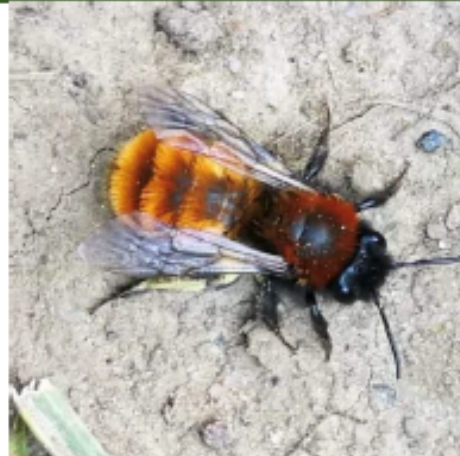
Tawny Mining Bee, Female The female is a lovely bright red-brown colour all over. They nest in the ground.