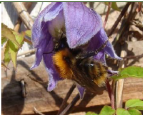
Common Carder Bumblebee, Queen It is brown all over but can be various shades of dark to yellow brown.