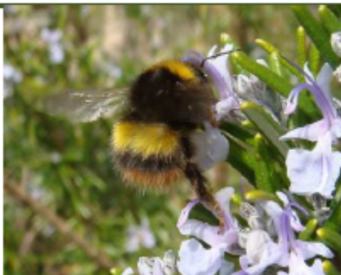
Early Bumblebee, Queen This is normally a smaller bee than the buff and white tailed bees. It has a very small orangey tip at the end of the abdomen.