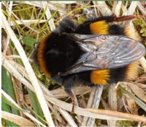
Buff-tailed Bumblebee, Queen This is probably the most common garden bumblebee in spring. The yellow bands are an orange/egg yellow, and the white band at the end of the tail (thorax) has a buff/soft edge to it.

All of the bumblebees pictured here are queens, males and workers (also female). They can have different colours but as queens are the ones we first see in spring (they have just come out from hibernation) we are going to keep it simple and focus on them.