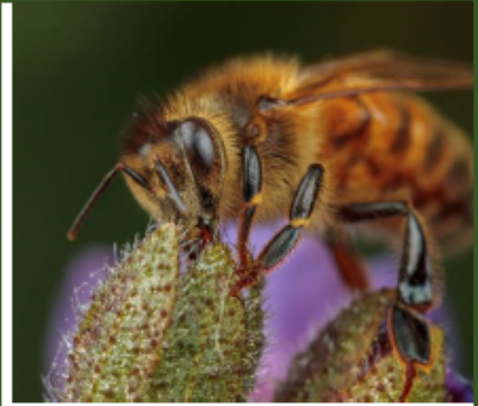
Honey Bee It's abdomen is quite long, and it can be all dark or have some more orangey segments nearer the thorax. They have hairy eyes and long legs which hang down when they fly.

White-tailed bumblebee- There is no picture for this one. It is very similar to the buff-tailed but the yellow bands are more of a lemon yellow and the white band on the tail has no buff edge.