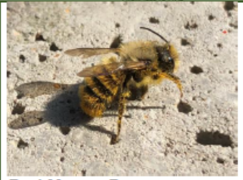
Red Mason Bee This is the most common mason bee which is often found in gardens. You may find it looking for nest holes between bricks, especially on the sunny side of your house or garden wall. Solitary bees like south facing nesting sites.