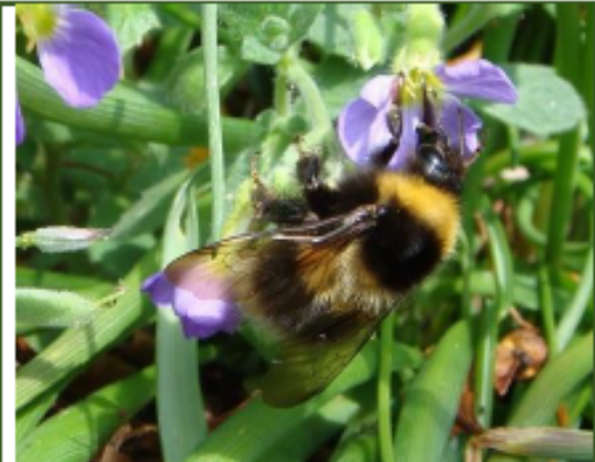
Garden Bumblebee, Queen It has a yellow band in the middle (end of thorax, top of abdomen). It also has a long face and tongue so it's good at feeding from deep flowers like foxgloves.