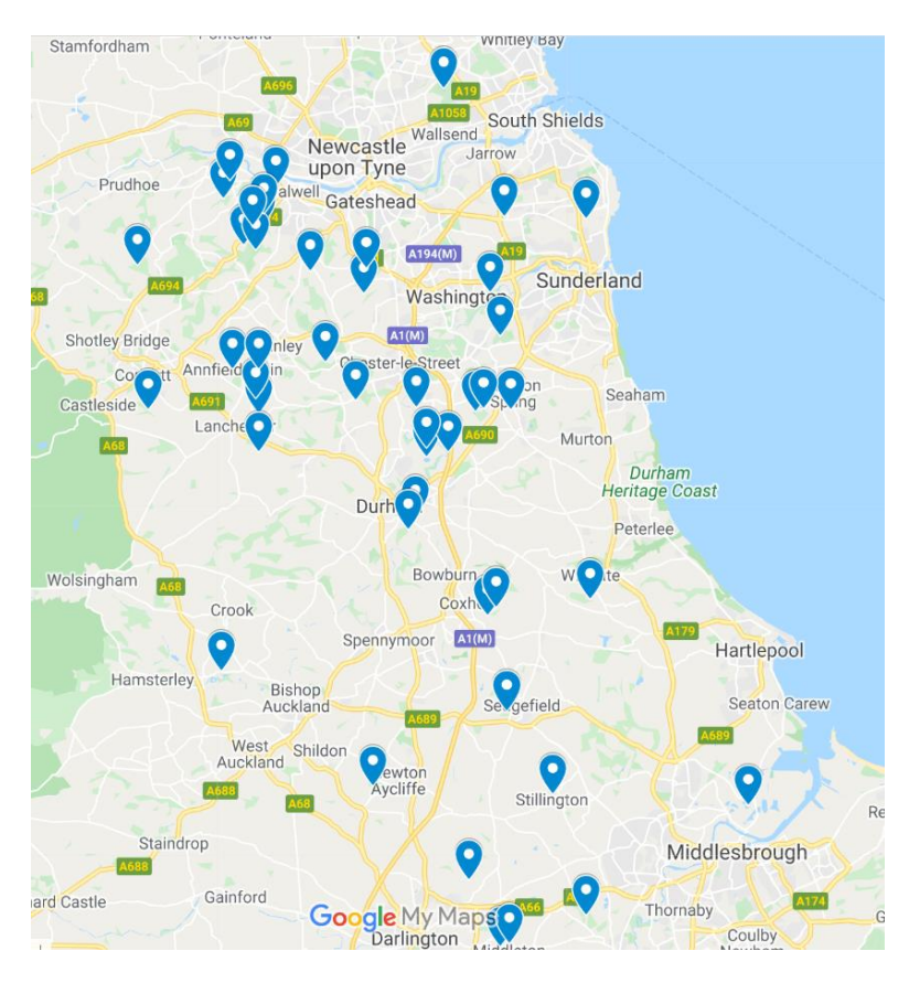
Fig 1: Sites Surveyed in 2019 available at <a href="https://tinyurl.com/wmpybjw">https://tinyurl.com/wmpybjw</a>