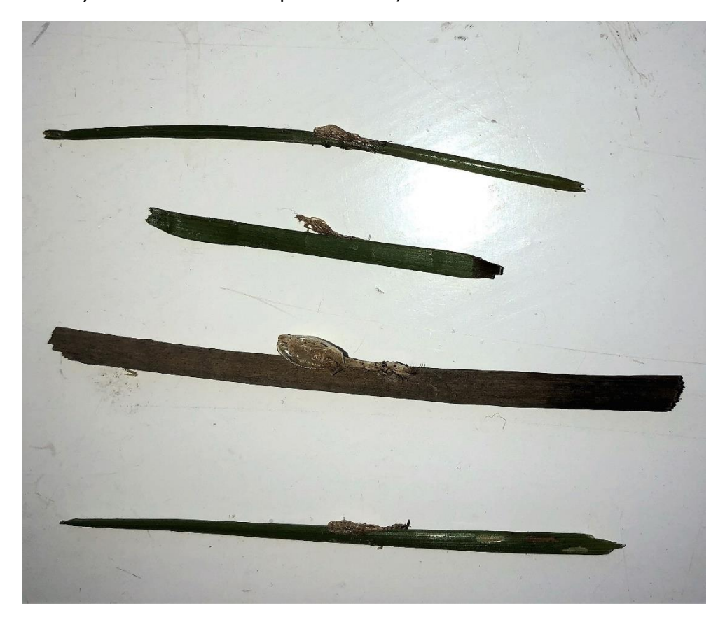
Mayfly Exuvia - Rainton Meadows May 2019

Spring 2019 was very warm, and as mentioned earlier, frogs were spawning in February. It was also not long until a prolonged period of rain started and ponds that had dried out during 2018 were full and ready to receive egg laying Odonata early in the season. Interestingly, at an ID training session at the previously dried out ponds at Rainton Meadows in May 2019, mayfly exuvia were found in large quantities. After some initial confusion as to what they were (confirmed by the Riverfly Partnership) it was apparent that the ponds had contained water for a sufficient period for Mayfly egg laying and emergence (well before any Odonata had been spotted there).